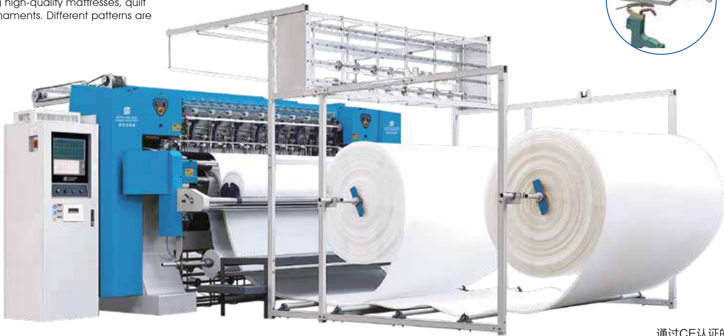
通过CE认证的安全保护标准 CE certificate

绗缝高级床垫、床上用品、居家装饰等产品上的各种花型 It is widely used for quilting high-quality mattresses, quilt covers, and household ornaments. Different patterns are available.